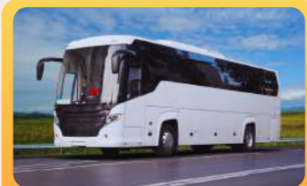
BUSES & COACHES

One Tour, Three Cities, Endless Memories - Golden Triangle with NCD