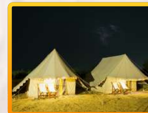
Camp & Tent Stay